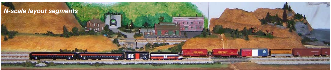
N-scale layout segments

The N-Trak Train Club once again set up a large model train exhibit that they continue to expend each year. Other vendors for the day were: The Big Flats Fire Department with Sparky the fire dog, visiting from West Elmira Fire Department, the Economic Opportunity Program adult literacy folks enjoying their first time here, and the Family Reading Partnership of Chemung County (they are the little red bookshelf people), handing out books to the kids. Harris Hill Juniors showed off one of the gliders, and the Twin Tiers Honor Flight signed up a few veterans for a trip to Washington D.C.