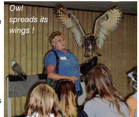
Owl spreads its wings!

Saturday September 10, 2016, the 24th Annual Community Soaring Day was held at the National Soaring Museum. Joining us were beautiful falcons, hawks and an owl from Baywings Falconry, presenting two shows which were filled each time. Between shows, people got up close to these magnificent birds.