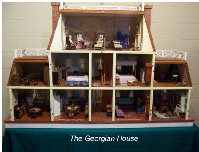
The Georgian House