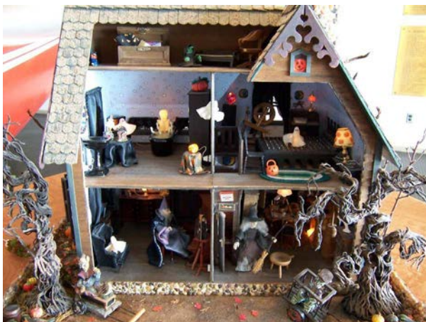
Pam Burton's famous Haunted House!