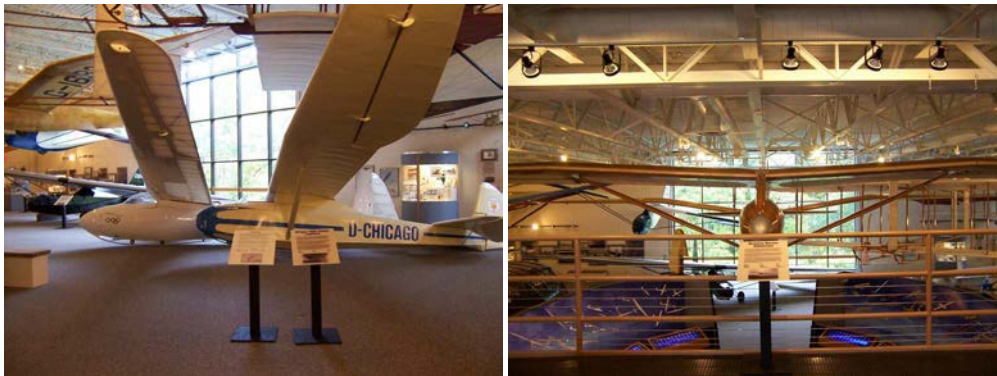
Display signs now mounted on stands, giving a more unobstructed view of the artifacts

Since assuming the position of Director in August, I have had no shortage of projects around the museum. My very first effort has been improving the museum display signs. I found the hanging display plaques and information panels to be difficult to read and they tended to obscure the view of the artifacts, and the museum in general. They were also a safety hazard – people ran into them constantly, and a few of them were in very poor condition. To correct these problems, I started with having the signs removed at the end of September. Most of the signs will be reused, either on new stands or mounted on walls. We will also make new signs as required. This project will be completed over the winter months.