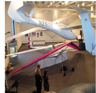
The Hang Gliding Club in our Blossom Gallery gave kids the “feel” of free flight

Also on hand were the Chemung County Humane Society with a few of their adoptable pets, the Corning Museum of Glass flame-worker (who made a beautiful glass sailplane miniature), New York State