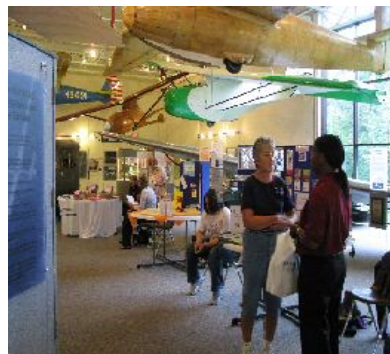
Community & Health Agencies set up in the Main Gallery

Those who were hungry enjoyed Harris Hill Soaring Corporation Juniors’ Bake Sale, and outside the West Hill Fire Dept. cooked lunch under the big tent, while the local ham radio club did an amateur radio broadcast of the soaring event. New