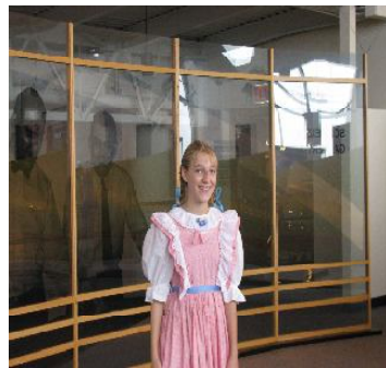
Becky Thatcher from the Chemung Chamber Mark Twain Country greeted our guests

Also on hand were the Chemung County Humane Society with a few of their adoptable pets, the Corning Museum of Glass flame-worker (who made a beautiful glass sailplane miniature), New York State