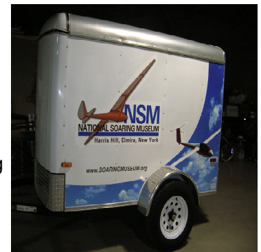
Stunning new trailer to transport simulator to local schools