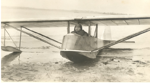
Above: For our friends at the Glenn Curtiss Museum - German Pruefling glider converted to seaplane glider at Port Washington, NY in 1930